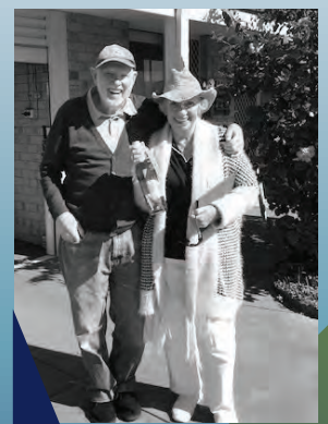
Cambrai Village 20th Anniversary and Merriwa Estate 25th Anniversary