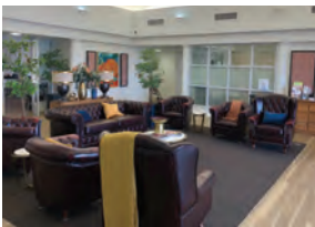
Refurbishments at both McNamara Lodge and Gordon Lodge

“ The staff treat my mum with genuine care & respect & involve her in as many activities as she is able to do. We are informed of any changes in her health & actions to be taken. ”