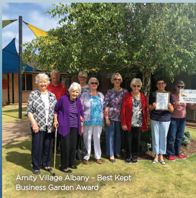
Amity Village Albany – Best Kept Business Garden Award