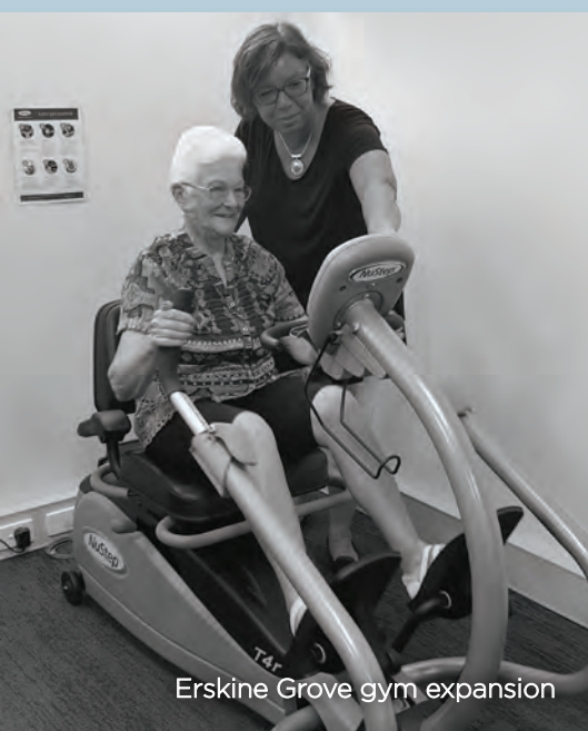
Erskine Grove gym expansion